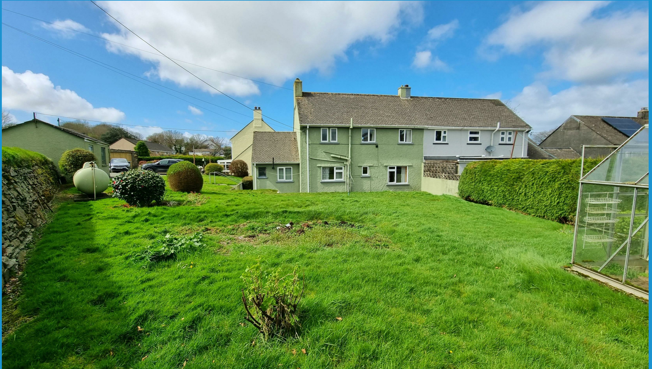
Penpont View Five Lanes | Launceston